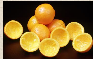
EXTRACTED PEEL HALVES

333 Avenue M, NW PO BOX 713 Winter Haven, FL 33882