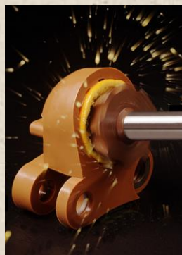
REAMER AND CUP