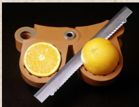
KNIFE HALVING FRUIT

The degree of juice extraction is determined by the amount of air pressure applied to the cups and by adjustable stops which limits the cups' clearance with the reamers. This feature provides positive control of reamer penetration and allows accommodation for peel thickness variations. Adjustments for extraction pressure can be made quickly, and while the extractor is in operation. The Brown family of citrus juice extractors can be equipped with a variety of cups and reamers to help meet customer's requirements. All Brown extractors are designed for easy and quick access to their internal juice contact surfaces and working parts for inspection to insure complete sanitation.